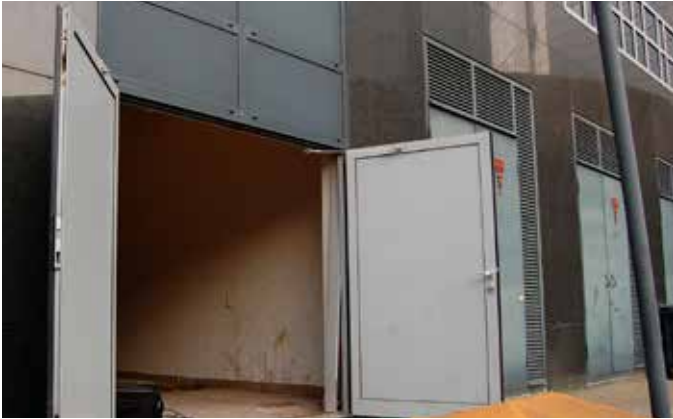
Indoor transformer rooms

Holland Shielding Systems B.V. has developed a new material for shielding / screening low-frequent magnetic fields. These fields are generated by installations in which currents flow, for example transformer rooms, power lines, busbar systems and nearby high-voltage cables.