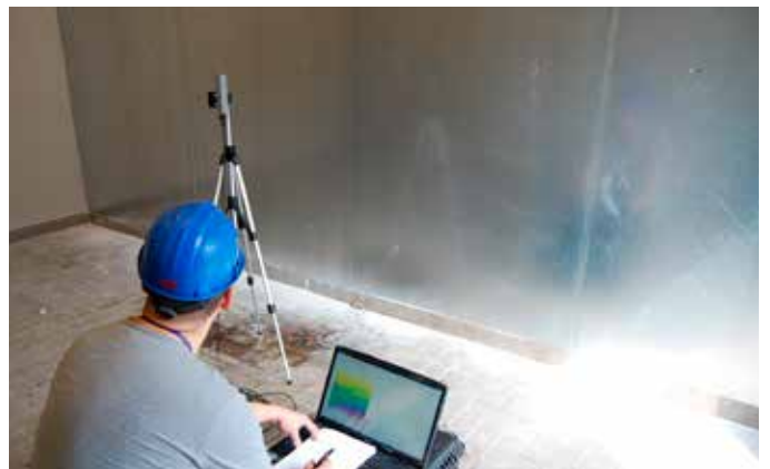
MuFerro™ 6800 wall shielding