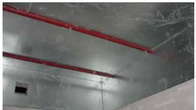
MuFerro™ 6800 ceiling umbrella construction

Due to space restrictions, one of our customers was forced to create a workspace in a room which had formerly been used as a warehouse and that was located above power transformers. After the magnetic fields were noticed by flickering computer displays, we were asked to carry out a magnetic field measurement. It was found that the magnetic field strength was far above the standard referred to above: it was 750\text{nTesla} . The magnetic field was reduced by installing an umbrella construction of MuFerro™ 6800. After completion of this project, the magnetic field measured only 80\text{nTesla} .