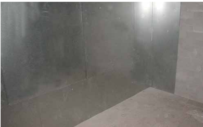
Magnetic field strength measurement

MuFerro combines permeable and satiety characteristics wich makes it extremely suitable for screening low-frequent magnetic fields.